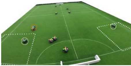
Fig. 2. Attacker shown in the red circle has the ball with the other two teammates located in their assigned dynamic zones.