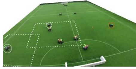
Fig. 3. Following Figure 2, a new dynamic zone is placed around the previous attacker and the teammate on the right is assigned the attacker role.