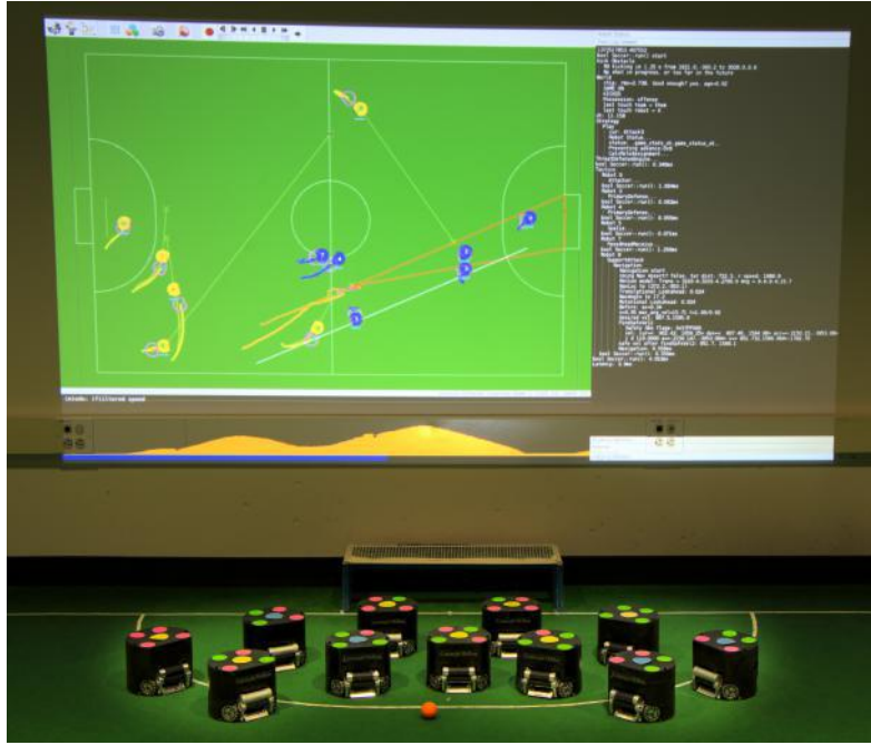
Fig. 1. CM \mu s team of soccer robots. In the background, our layered disclosure viewing and debugging tool [8].