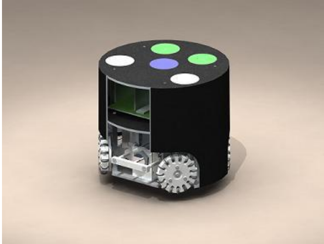
Fig. 3. Render of our robot.