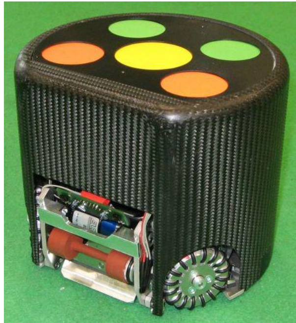
Figure1. Austrian Cubes robot

To observe the new rules for the vision we had to change our robot's skin. Additionally we improved the mounting parts of our skin, which came out to be not reliable enough.