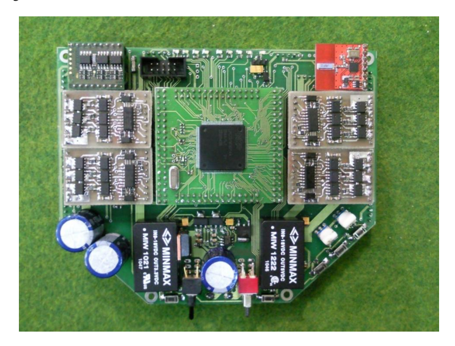
Fig. 2. The electronic main and daughter board

This year, our system consists of a main board and some daughter boards (DB). This approach simplifies the repairing process especially during the matches. Most of the problems came out from the damages happens in Processor Daughter Board (PDB) because of connecting its pins directly to the power systems. To lower these damages, all I/Os were isolated from the power section, using optocouplers [1]. Figure 2 shows the main board and its modules.