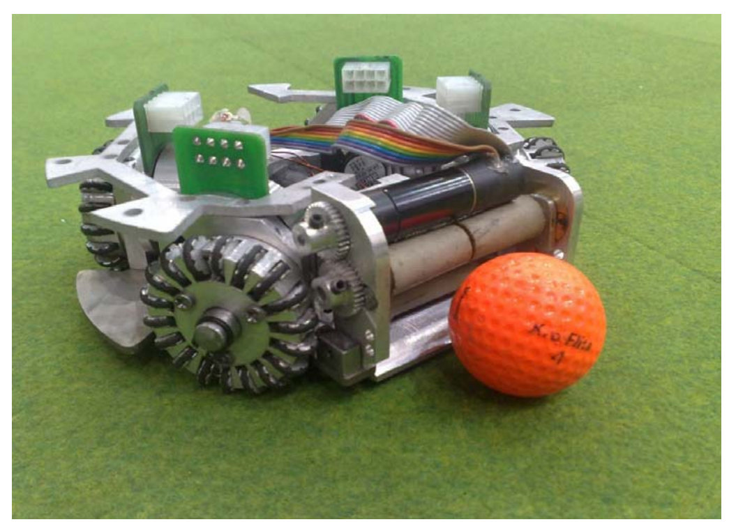
Fig. 4. Robot 2010 mechanical structure

The mechanical system of small size robot consists of wheels, kicker, dribbler and motion system. Some problems in the previous design encouraged us to change the materials and mechanical design.