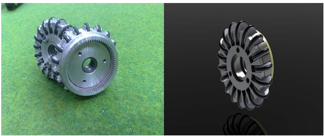
Fig. 5. Wheels of (Left) MRL2010, (Right) Designed wheels for MRL2011