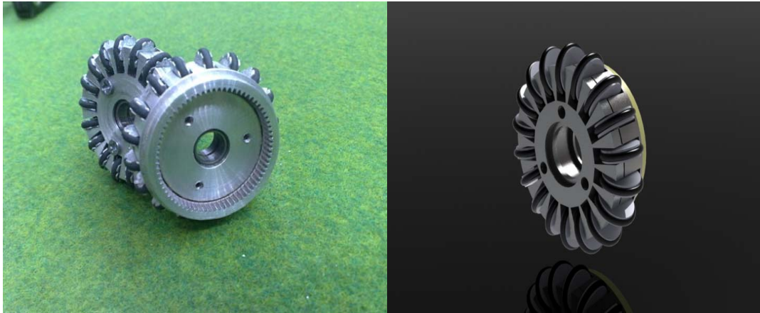
Fig. 5. Wheels of (Left) MRL2010, (Right) Designed wheels for MRL2011