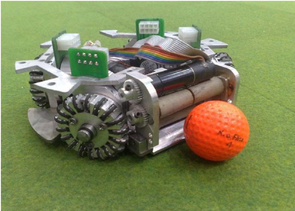
Fig. 4. Robot 2010 mechanical structure

The mechanical system of small size robot consists of wheels, kicker, dribbler and motion system. Some problems in the previous design encouraged us to change the materials and mechanical design.