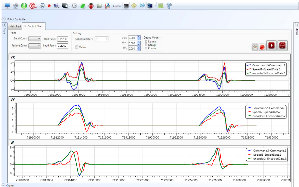
Fig. 1. User Interface of the AI, showing the viewer and settings Box

As stated before, to debug onboard control modules such as wheels' speed and controller parameters a comprehensive debugging tool is required. Investigation of the commanded velocities and the robot velocities computed via vision and encoder data simultaneously is desired. By using this new approach we can easily debug and analyze our PID controller, wireless module data or any of our internal components. We've designed an online link between our microprocessor and AI systems in order to enable us to debug and maintain all controllers and speed problems easily and in a time optimal fashion. Fig. 1. shows our internal debugger graphical interface. In this figure the mentioned data are shown. If the desired velocity and robot speed measured by vision are similar, the control performance will be suitable.